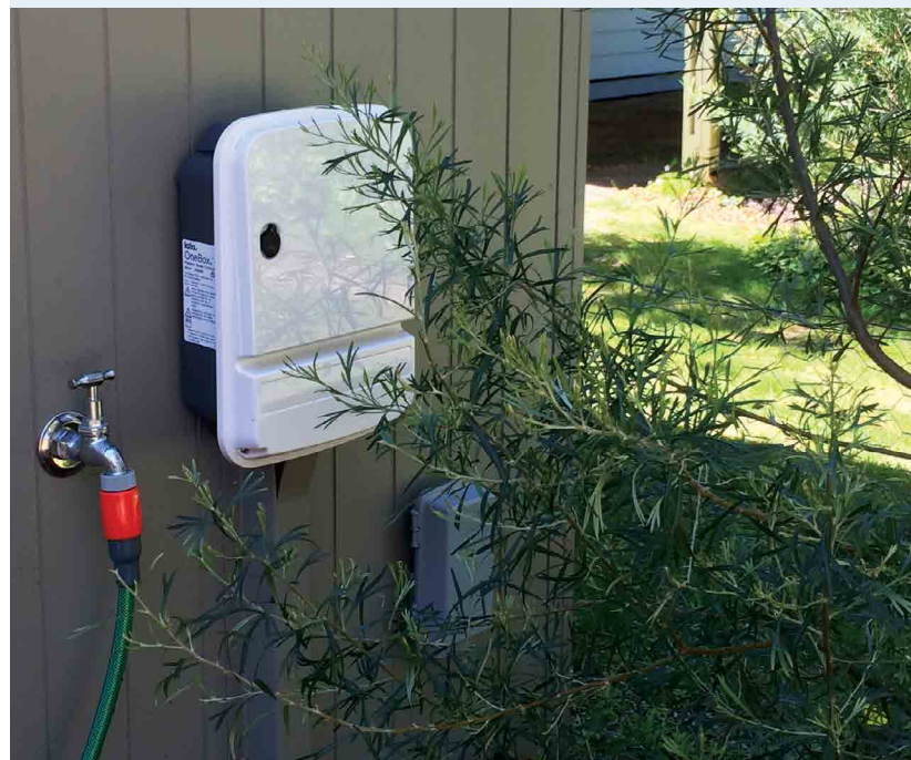
Your OneBox® device is compact and unobtrusive.

* Other than those used in normal domestic products such as dishwashing powder, detergents and hair dyes.