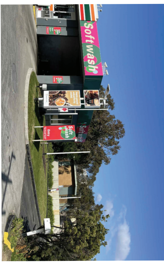
Sixth Avenue. Existing stack viewed from corner of Nepean Highway and