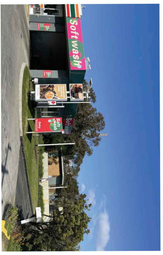
and Sixth Avenue. New 15m tall stack viewed from corner of Nepean Highway