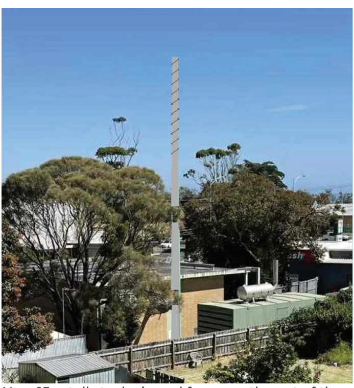
New 15m tall stack viewed from south-east of the pump station.