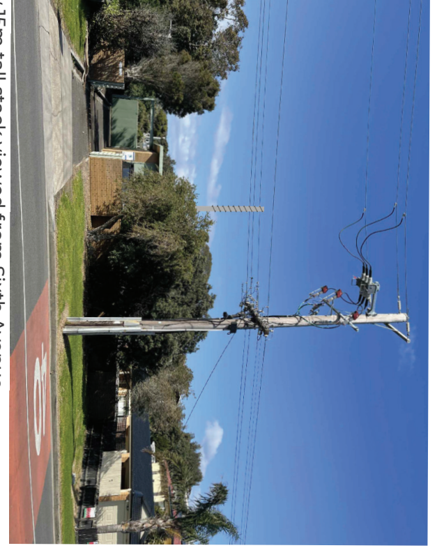
New 15m tall stack viewed from Sixth Avenue.