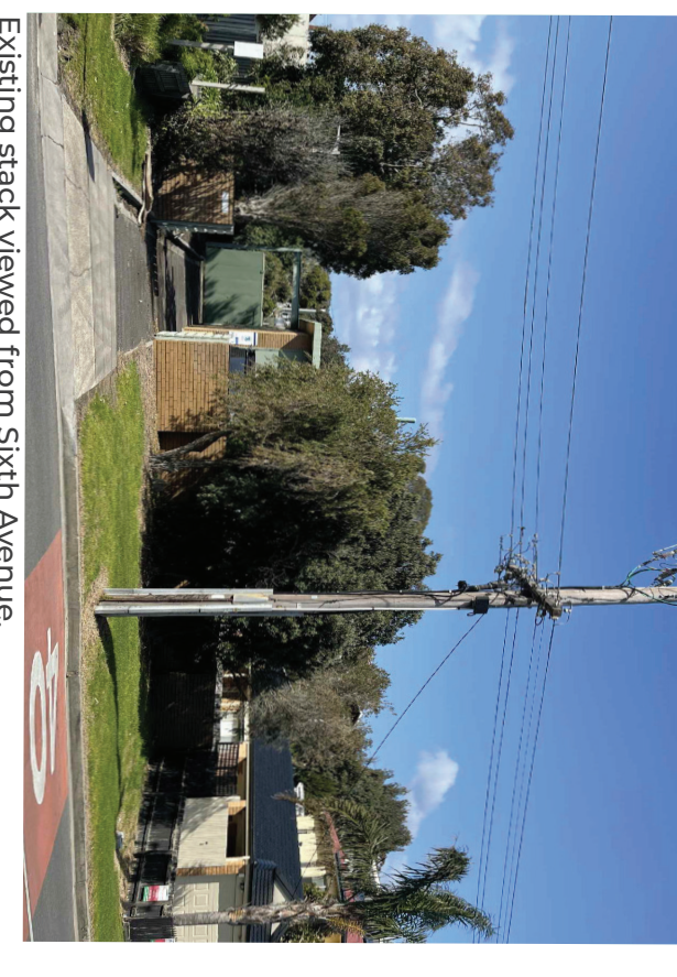
Existing stack viewed from Sixth Avenue.