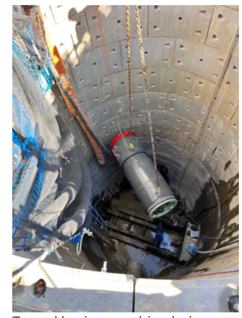
Tunnel boring machine being prepared to launch towards Worksite 1.