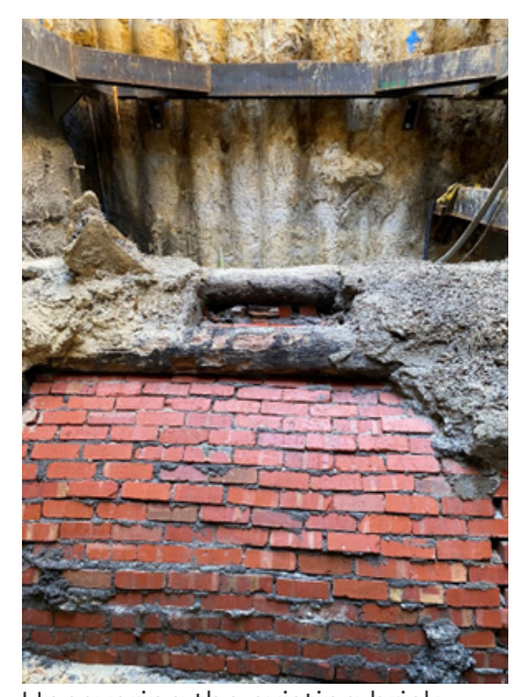
Uncovering the existing brick sewer at Worksite 1.