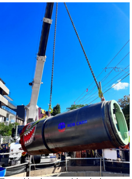
Tunnel boring machine being lowered into Worksite 2.