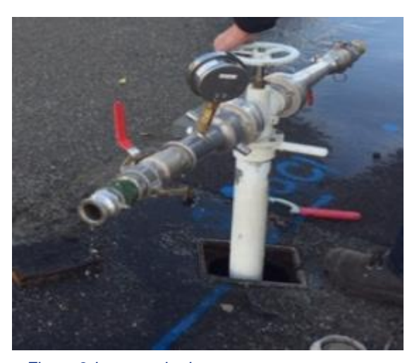
Figure 2 Incorrect hydrant test set up

These results will always return pressures significantly lower than those supplied by South East Water especially at high flowrates due to head loss through the hydrant and associated equipment. If a fire service designer wants to obtain comparable results then they need to follow the testing method as