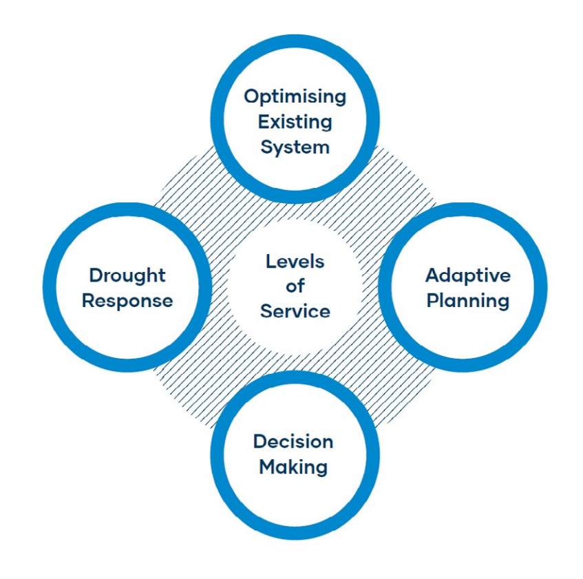
Figure 1: Water Security Framework

The water security framework is shown below: