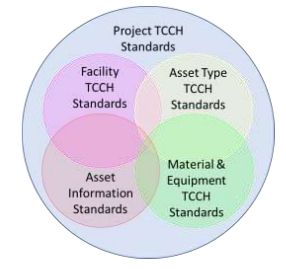
Figure 2: Overview of Types of SEW TCCH Standards

There are a number of types of Technical Standards that include TCCH requirements as illustrated in Figure 2 and listed in Table 2. Where a project requires TCCH standards that are not available for facilities, asset types, equipment of asset information systems, this needs to be flagged at project inception and a process agreed on for developing these requirements in the early phase of the project.